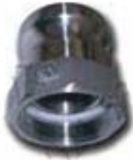
DIN2828 Part A