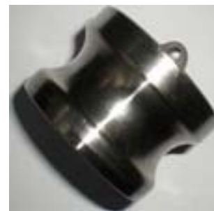
Part DP - Dust Plug