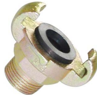
European type Male end