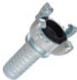
US type Hose end 4-lug