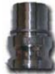
DIN2828 Part E