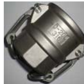
Part C - Female coupler / Hose tail