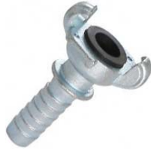
US type Hose end 2-lug