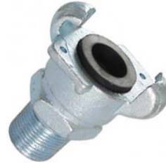
US type Male end 2-lug