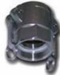
DIN2828 Part D