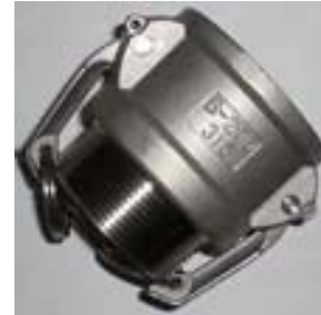
Part A - Male adapter / Female thread