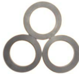
Gasket for Cam & Groove