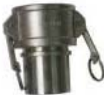
DIN2828 Part C