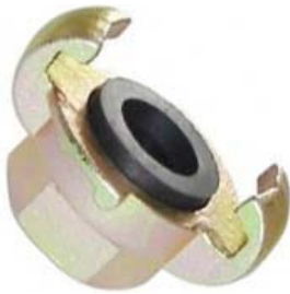
European type Female end