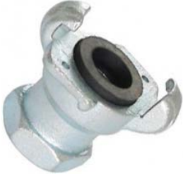
US type Female end 2-lug