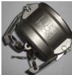
Part DC - Dust Cap