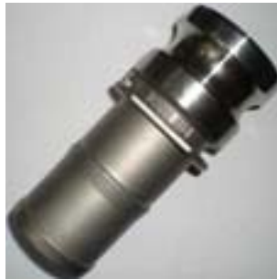
Part E - Male adapter/ Hose tail