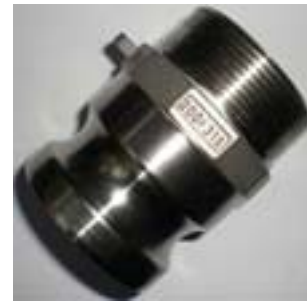
Part F - Male adapter/ Male thread