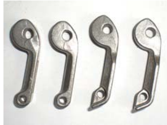
Handle for Cam & Groove