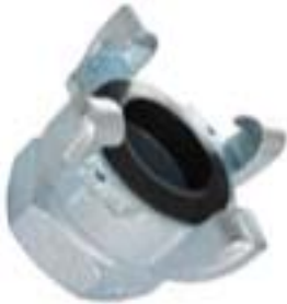
US type Female end 4-lug