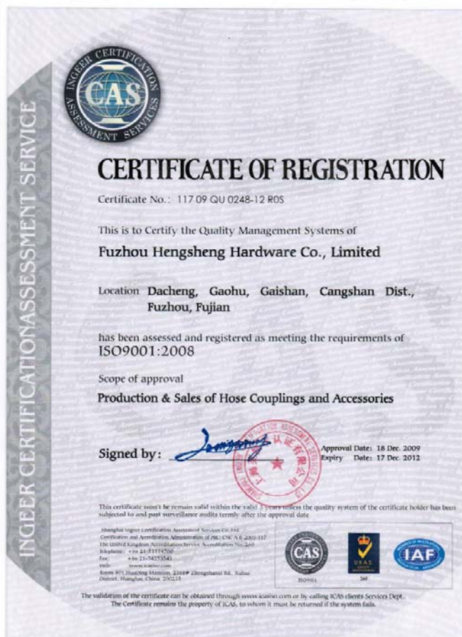
ISO9001 certificate (CN)