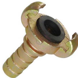
European type Hose End