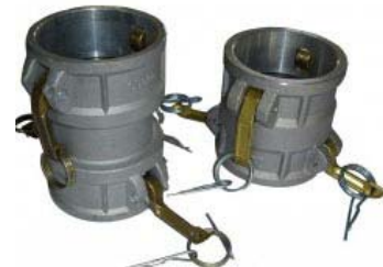
Part DD - Coupler x Coupler