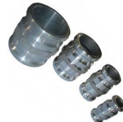
Part AA-Adapter x Adapter