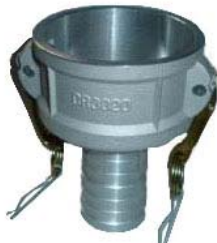
Part CR- Reducer