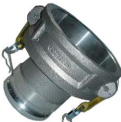
Part DA-Coupler x Adapter