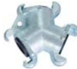
Three way end